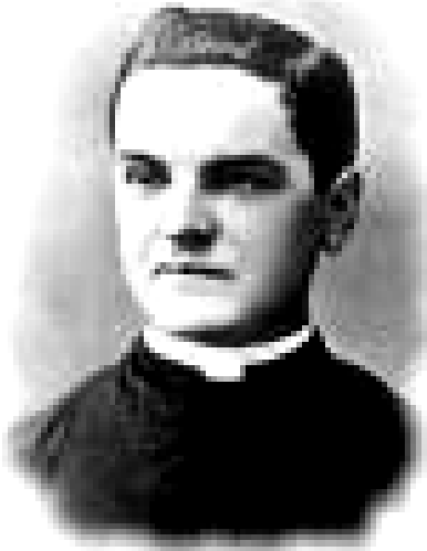
Father Michael McGivney Founder, Knights of Columbus

On March 29th, brother Knights around the globe will be commemorating the founding of the Knights of Columbus 127 years ago. Concord Council 112 has been around for 115 of those years and will have a special celebration at Sunday Mass at St. John the Evangelist Church at 11:00 AM.